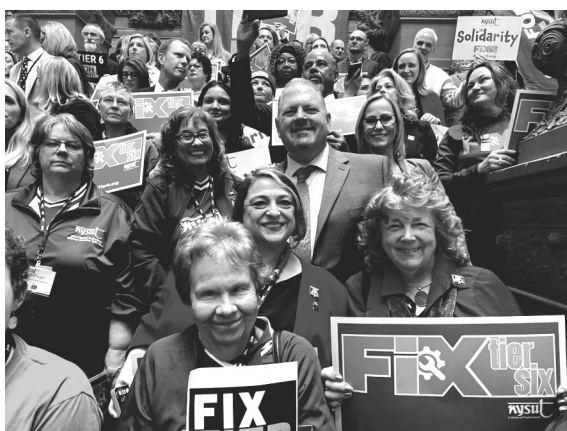
More than 600 NYSUT activists gathered on the Million Dollar Staircase at the State Capitol Building in a rally to FIX TIER 6.